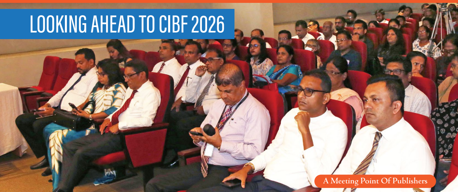
A Meeting Point Of Publishers

Join the excitement at CIBF 2026—25 September to 4 October at BMICH, Colombo 7! Local and international book lovers, exhibitors, and visitors: save the dates. Dive into a buzzing world of books, spark new connections, uncover hidden gems, and reignite your passion for stories in a fresh, collaborative vibe.