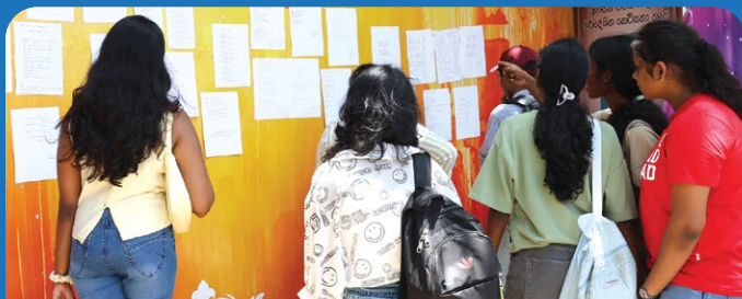
"Katapath Pawura" a place where visitors able to note their creative poems and verses

At the 26 th Colombo International Book Fair, more than 500 stalls will be present, featuring the publications of member institutions and government agencies offered at special discounts. Notably, over 30 international stalls will participate this year. A series of programs will be held alongside the fair, including book launches, cultural performances, workshops, reader-writer meetings, and other daily events designed to enrich the literary experience for all attendees.