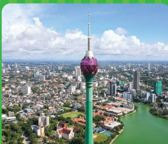
Colombo City Tour