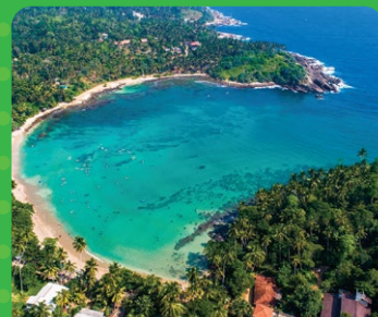
Beaches in Colombo & West Coast within one to three hours drive

SLBPA HQ : No. 83, Parliament Road, Sri Jayawardenepura, Battaramulla, Sri Lanka. Tel: +94 112 785 480 | Email: srilankabookpublishers@gmail.com | Web: www.cibf.lk