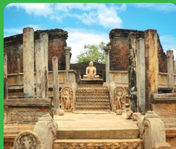
Ancient City of Polonnaruwa