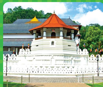
Temple of The Sacred Tooth Relic