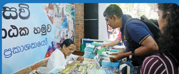
Reader - Writer Meetings