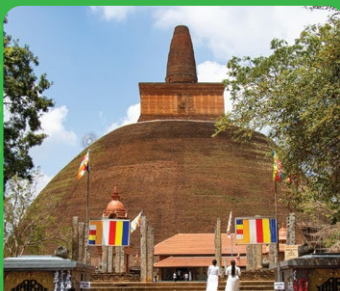
Sacred City of Anuradhapura